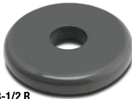
B-3-1/2 R (Round Stem)